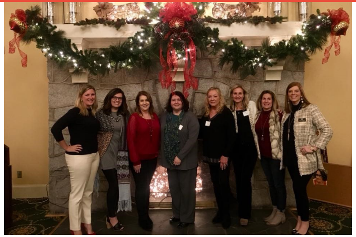
Above: Past Presidents at the December 2017 Dinner Meeting