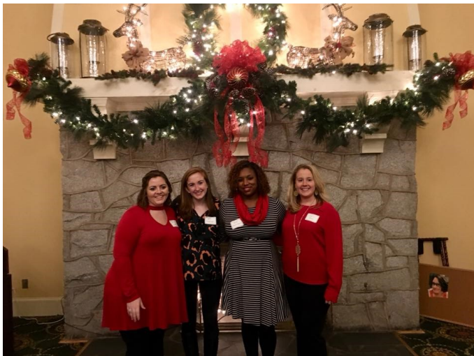
Above: Four members of the 2017-2018 Provisional Class