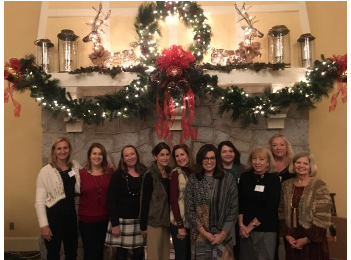
Above: Sustainers present at the December 2017 Dinner Meeting