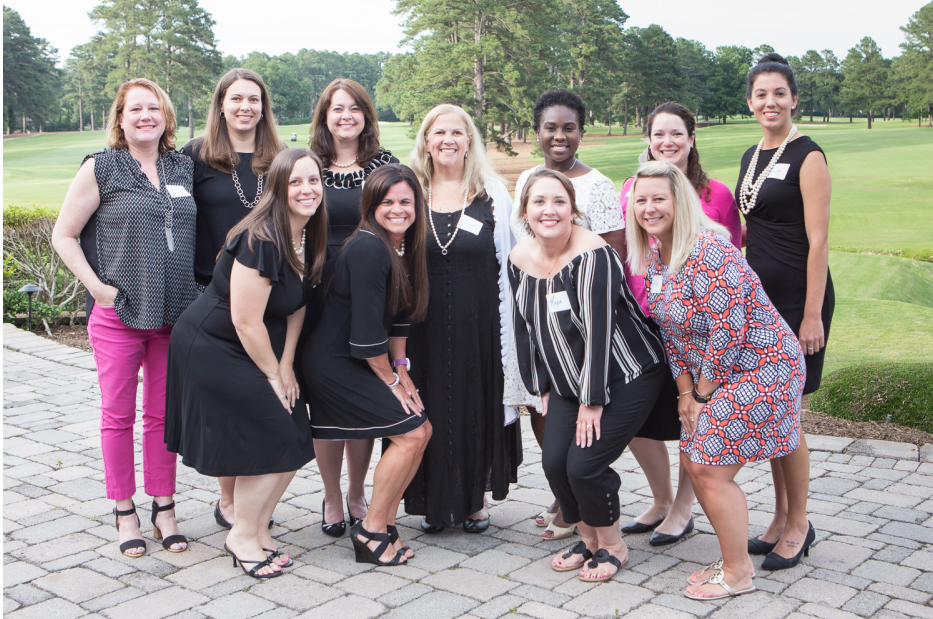
2014-2015 Junior Guild Class