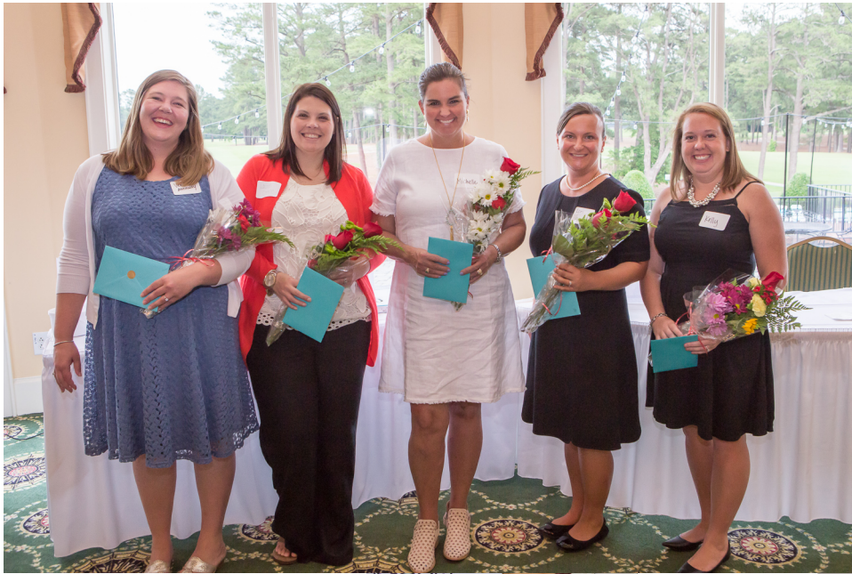
Pictured Left: 2016-2017 Junior Guild Class