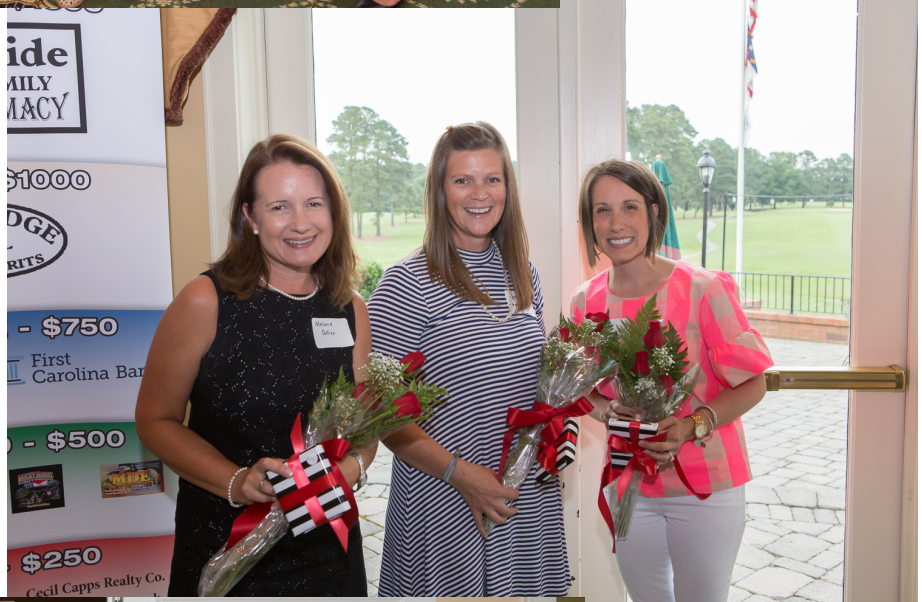
Pictured Right: Members going sustaining in 2017.