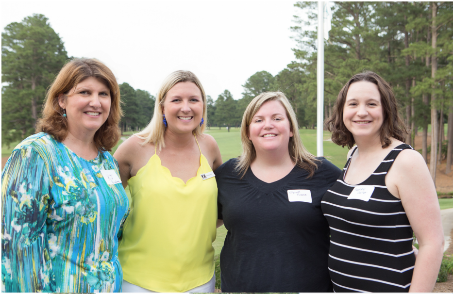
2013-2014 Junior Guild Class