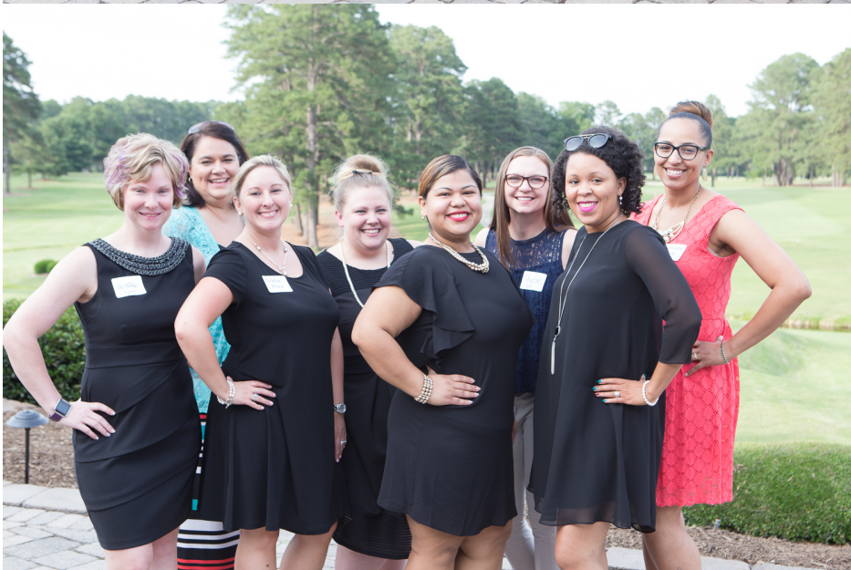
2015-2016 Junior Guild Class